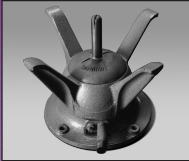
Model 100 — “Traditional” style rinser. Heavy-duty steel construction. Inverted barrel rests on cradle, which pivots on sealed bearings around a fixed bronze spray head.