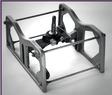
Model 200 — The Model 200’s extra-heavy duty, cast aluminum cradle holds the barrel stationary, while the high-pressure nozzle spins for optimum cleaning action.